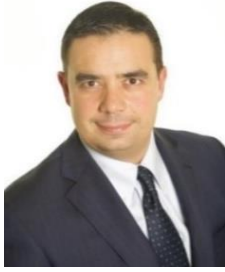
R&R Weekly Column By Brunello Rosa