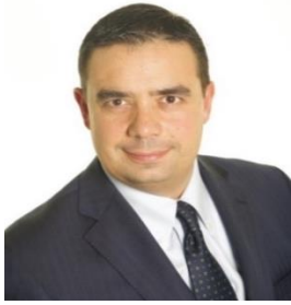
R&R Weekly Column By Brunello Rosa